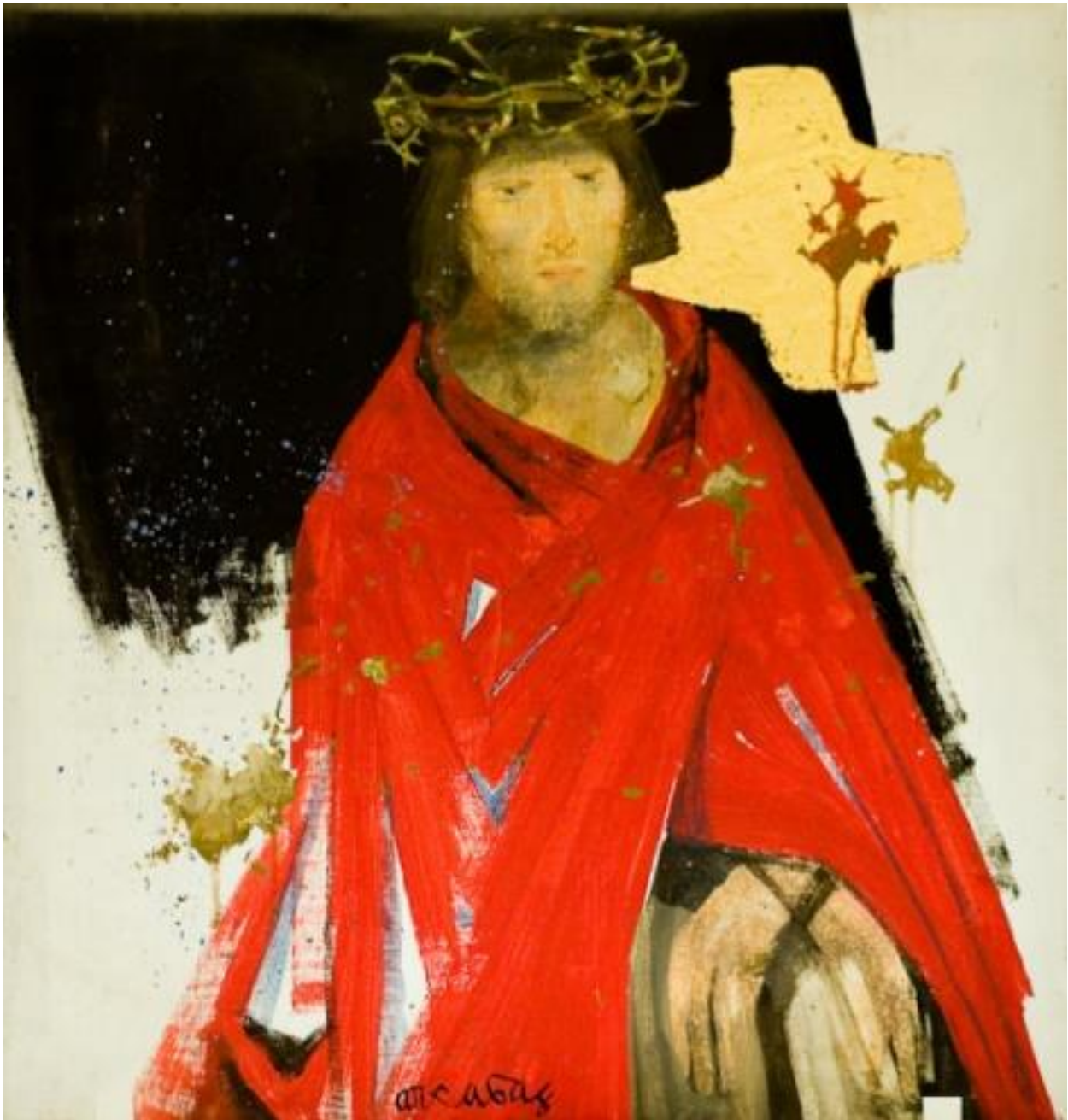
Outrage a Jesus Roi, Arcabas