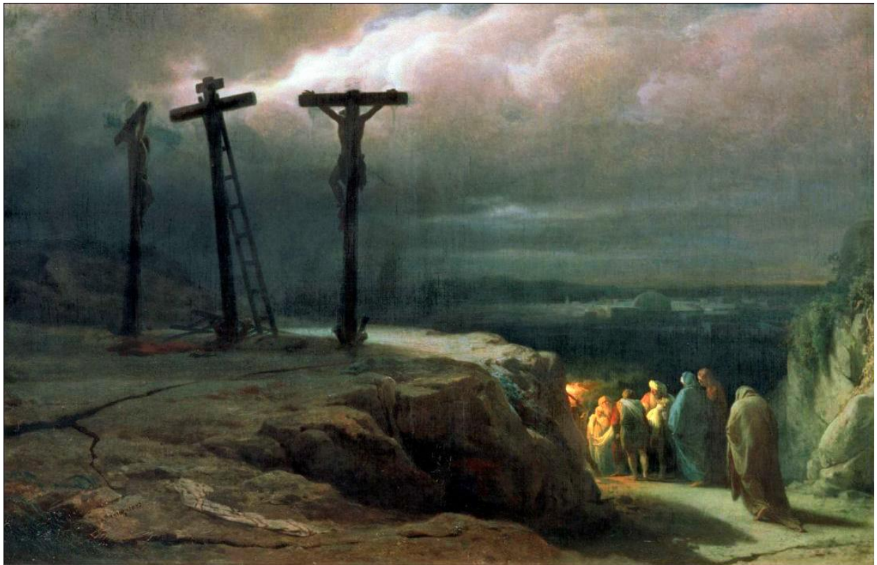
Night at Golgotha, Vasily Vereshchagin