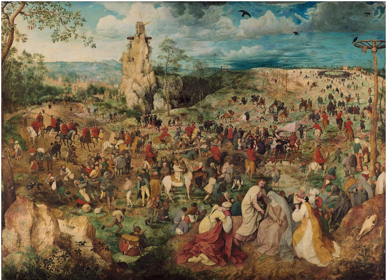
The Procession to Calvary , Pieter Bruegel the Elder