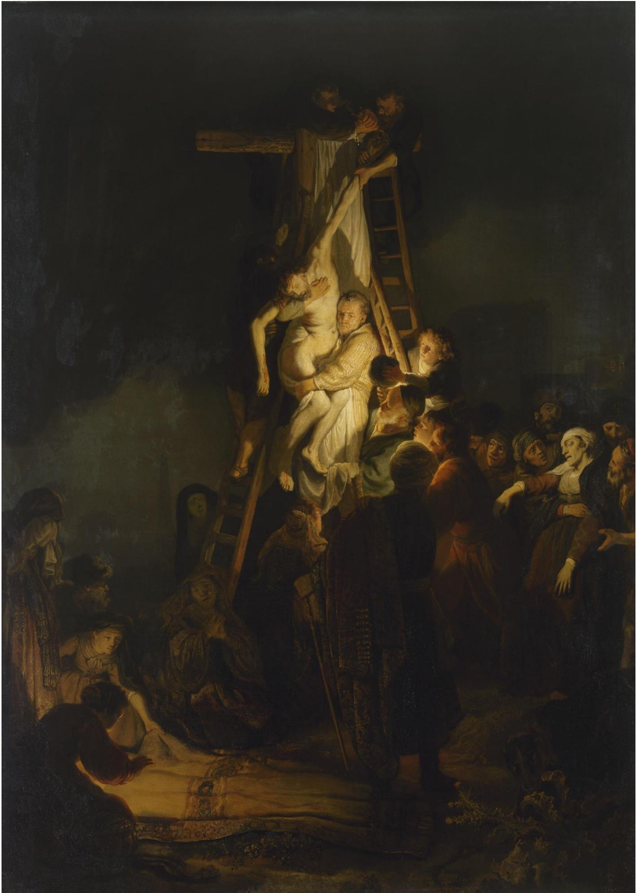
Descent from the Cross, Rembrandt van Rijn