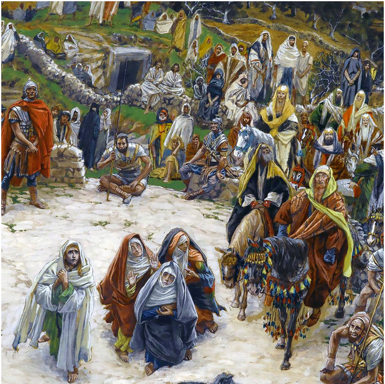
View From The Cross , James Tissot